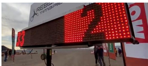
Shows Race Number and last 15 seconds countdown