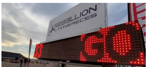
Shows Race Number and GO word – GO blinking for 3 seconds